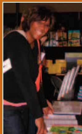
Exhibit Hall — The Exhibit Hall is filled with vendors who cater to home educators and desire to serve and minister to you.

Used Book Sale — This is for conference attendees only. A half table (three feet of display area) costs $5.